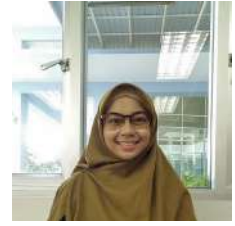
Suwaibutal Annisa Indonesia